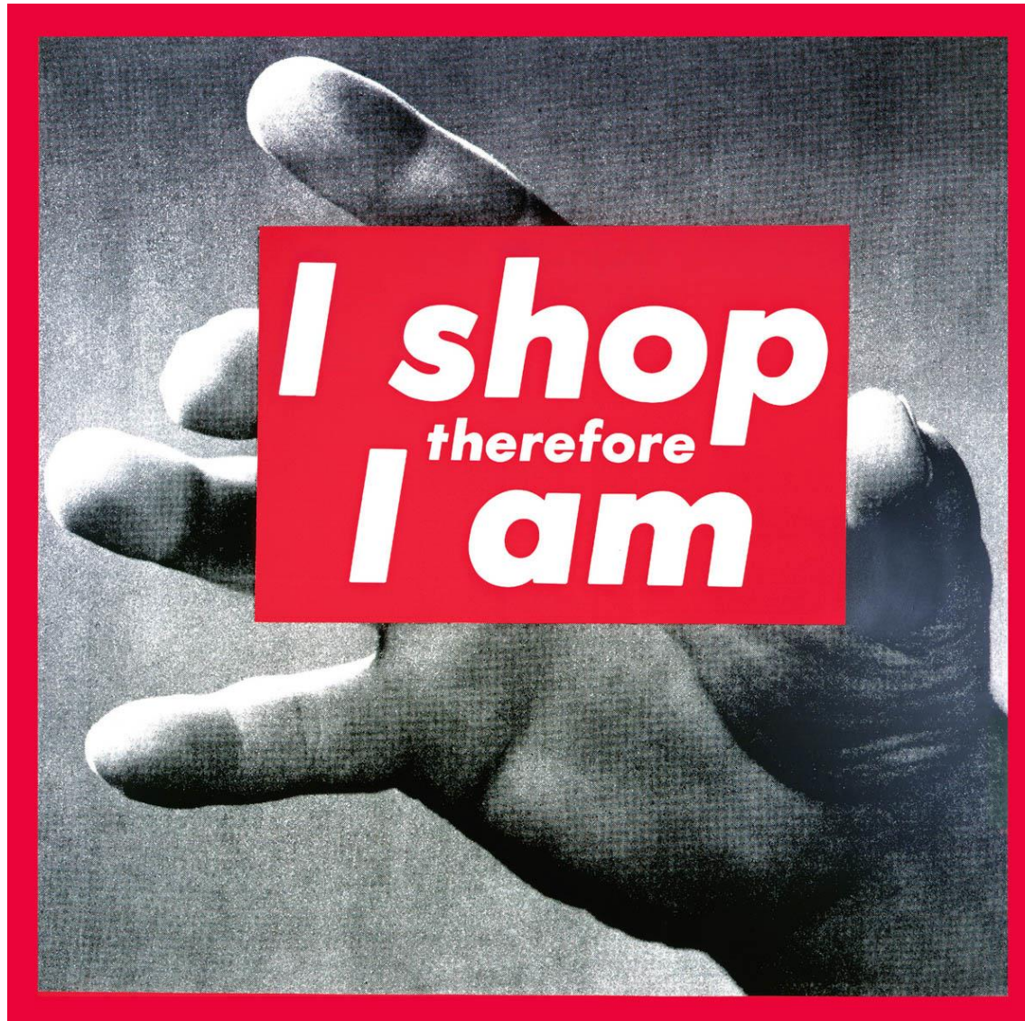
'I shop therefore I am' Barbara Kruger