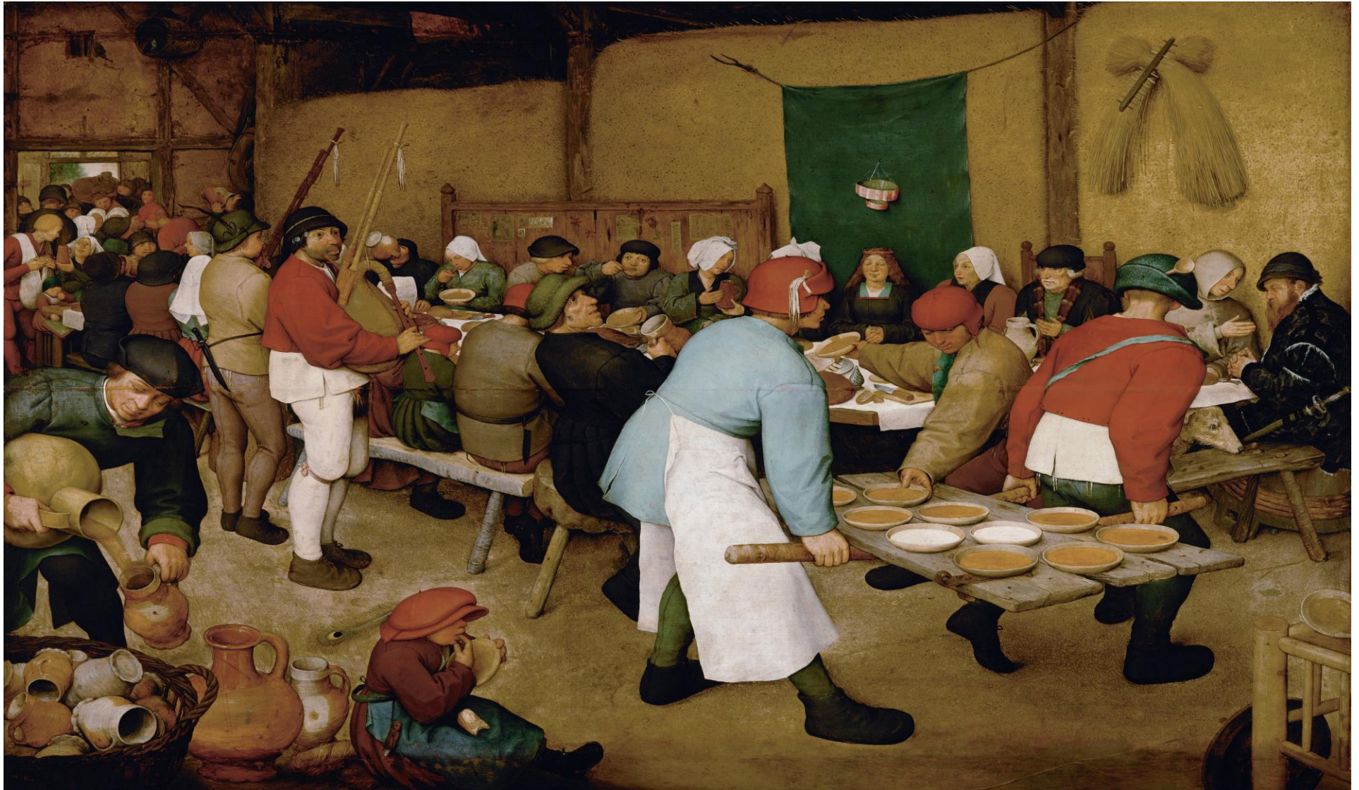
'The Peasant Wedding' by Pieter Bruegel (the elder)